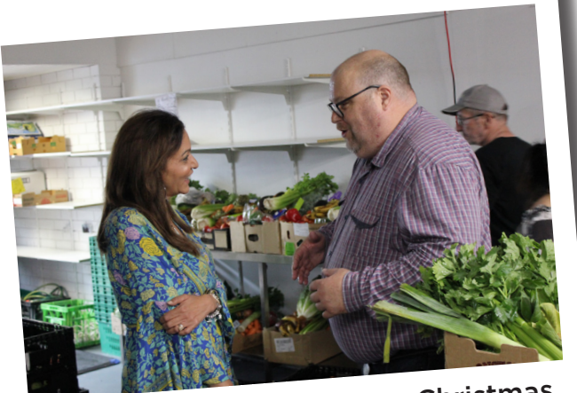
Dropping off the generous Christmas donations from the community to The Pantry