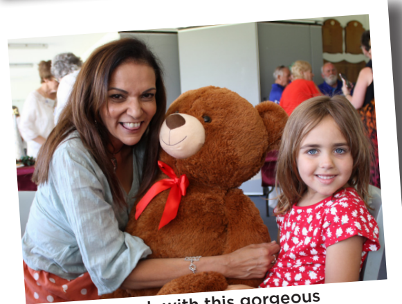
Brunch with this gorgeous girl (and a teddy bear!) at Grandparents Rearing Grandchildren Brunch